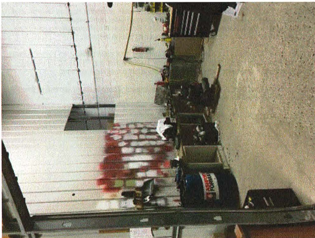
Image 2(Maintenance Shop) : Paint booth area is now a maintenance shop