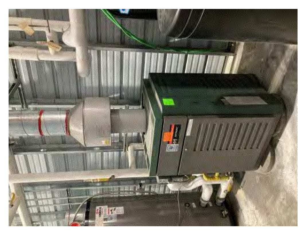
Image 2(Boiler) : Boiler used to heat the wash water in the paint prep wash booth