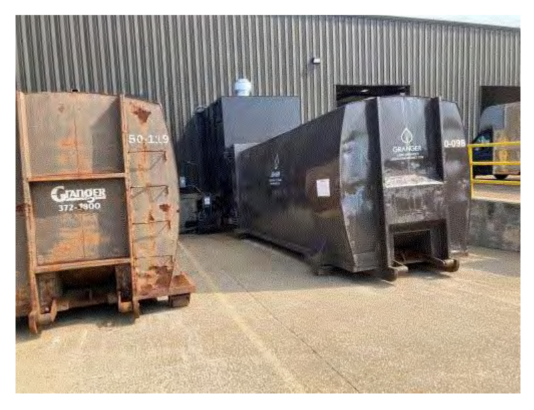
Image 4(Garbage gondola) : Garbage gondola, disposal of waste occurs from inside plant.