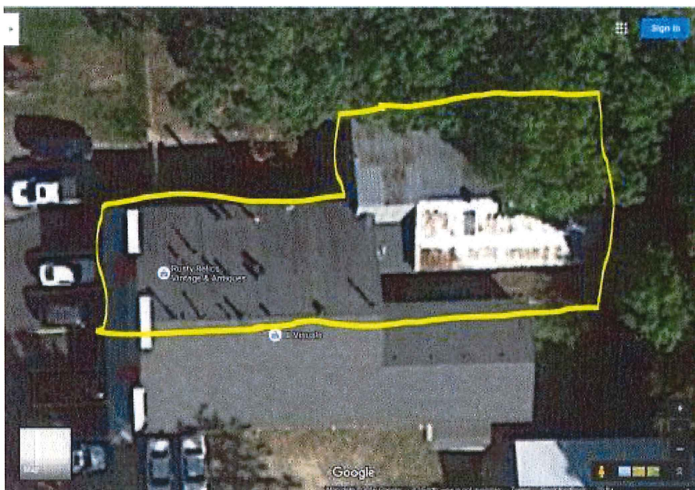
Image 1(Animal Angels, Googl) : Full image name: Animal Angels, Google Maps 2. This is a Google maps image of the Animal Angels building location. Note that I have highlighted the portion of the structure occupied by Animal Angels.