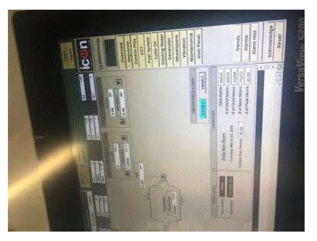
Image 2(Unit 11-4) : Control panel for Unit 11-4 which shows the hours meter for that unit. Photo taken by Stefanie Ledesma, DTE on March 23, 2021.

Image 1(Unit 11-1) : Control panel for Unit 11-1 which shows the hours meter for that unit. Photo taken by Stefanie Ledesma, DTE on March 23, 2021.