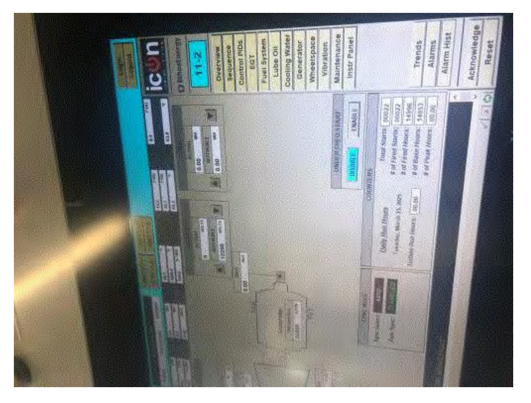
Image 3(Unit 11-2) : Control panel for Unit 11-2 which shows the hours meter for that unit. Photo taken by Stefanie Ledesma, DTE on March 23, 2021.