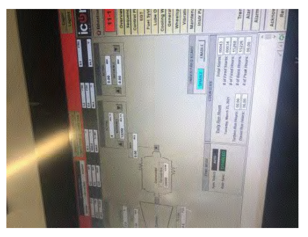
Image 1(Unit 11-1) : Control panel for Unit 11-1 which shows the hours meter for that unit. Photo taken by Stefanie Ledesma, DTE on March 23, 2021.