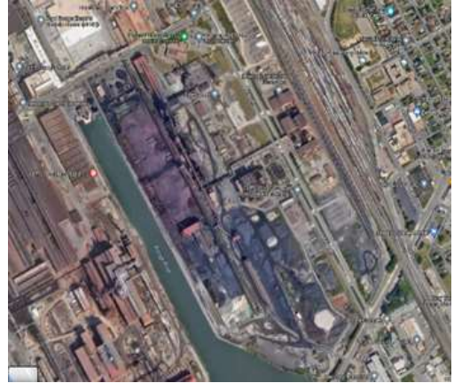
Figure 1: Aerial view of Cleveland-Cliffs

Cleveland-Cliffs operates an iron and steel mill located in Dearborn within the Rouge Industrial Complex. The plant produces steel slabs from iron ore and conducts finishing operations on flat rolled steel coils. The steel mill operations occupy approximately 500 acres on the southern half of the complex and include equipment to melt and mold metal. Portions of the mill are controlled by a device called an electrostatic precipitator or ESP, intended to reduce air pollutants from the process. This control equipment was installed in 1964 and although maintenance was performed, the ESP had not been completely overhauled or replaced since it was installed.