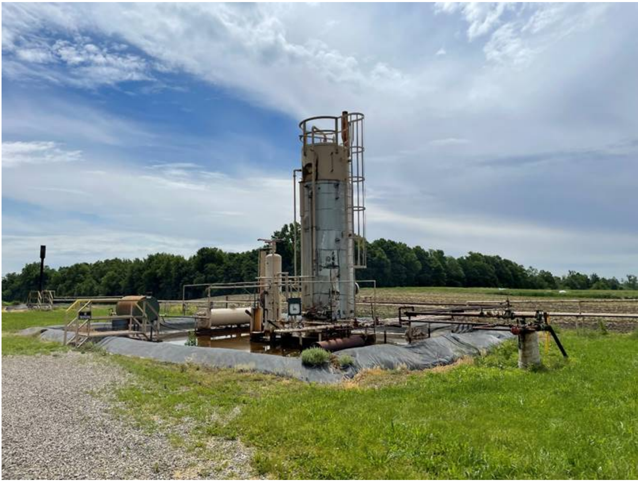
Image 7: Wessel 2-6A heater treater and line heater, with flare in background.