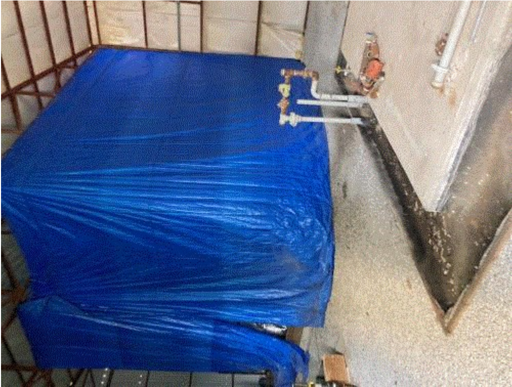
Image 4(Interior View -3) : Engine Condenser but no engine or stack