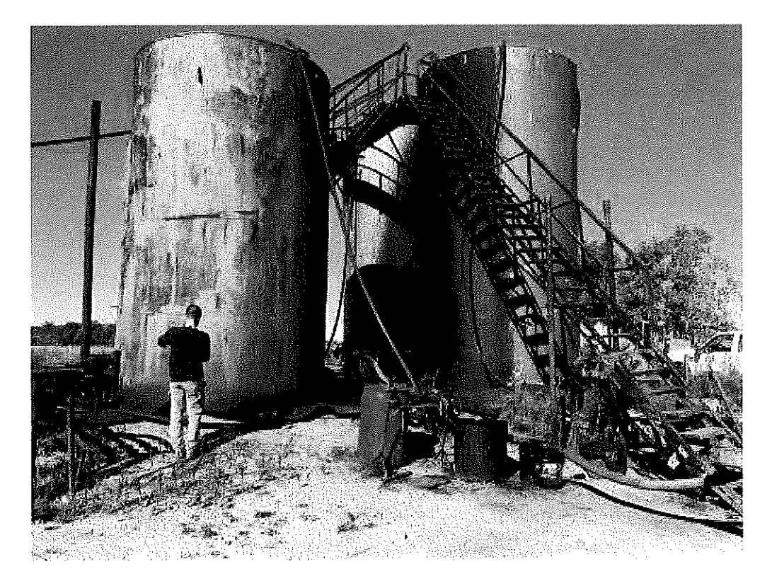
<u>Image 3(Photo 2.)</u>: Photo 2. Reference photo of the storage tanks in the northern storage tank battery at the time of our 10/8/19 inspection. Perspective facing west.