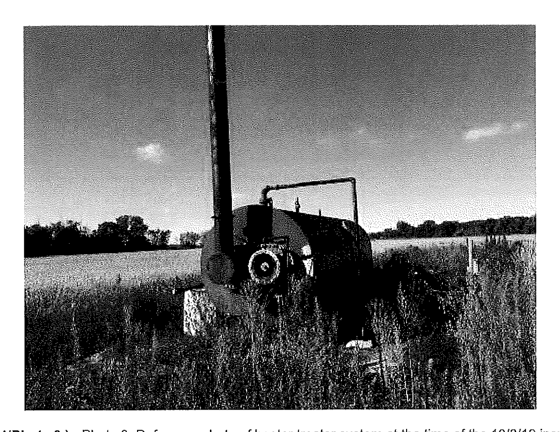
Image 4(Photo 3.): Photo 3. Reference photo of heater treater system at the time of the 10/8/19 inspection.