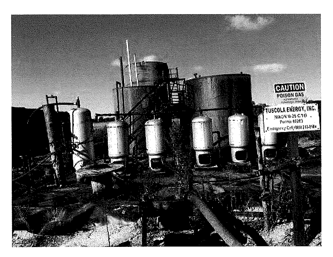
<u>Image 2(Photo 1)</u>: Photo 1. Reference photo of separators and storage tanks in the southern storage tank battery as it appeared on 10/8/19. Perspective facing west.