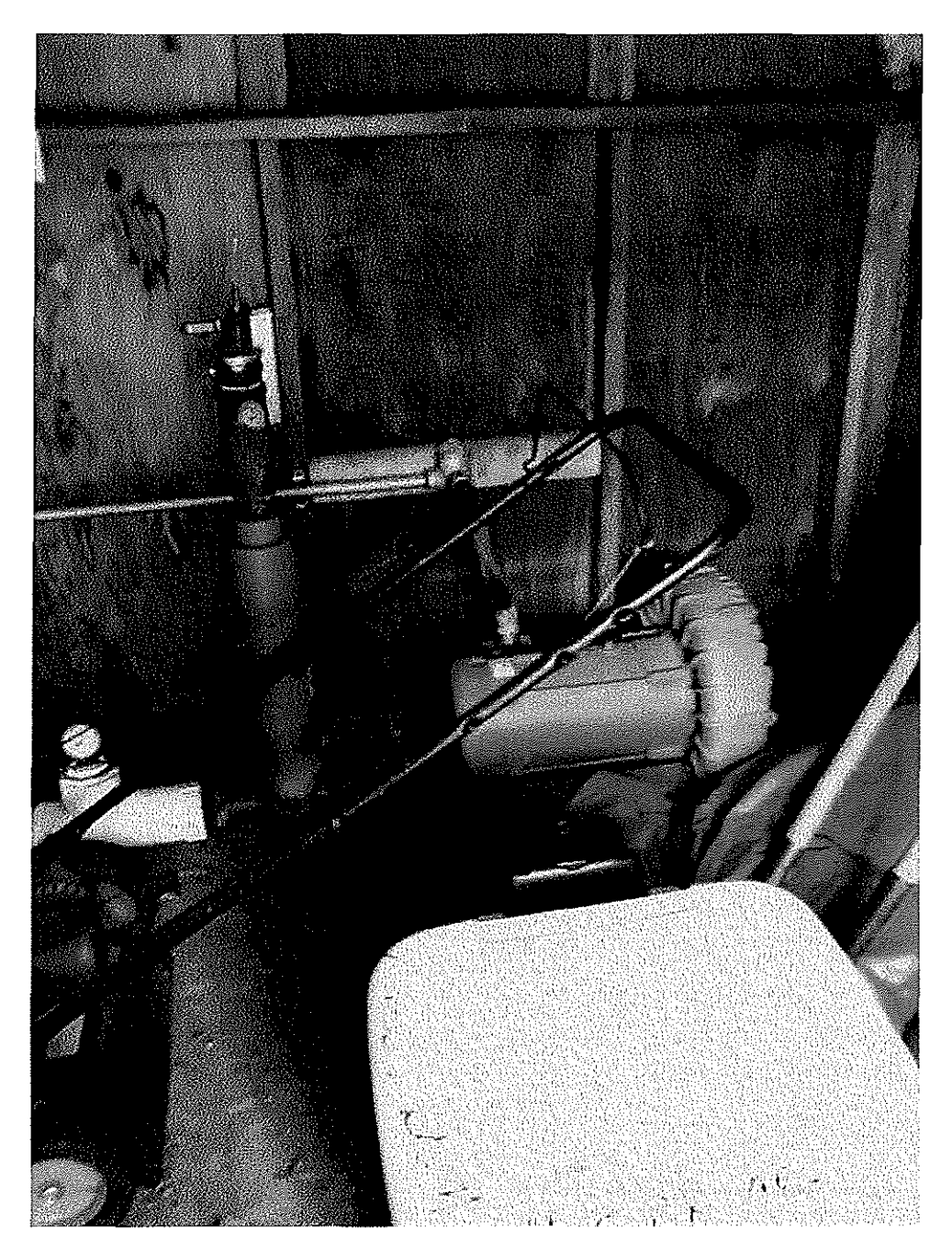
<u>Image 4(SVE System)</u>: Component of the SVE system which is attached to the pipe protruding out of the north side of the shed, once leading to the stack.

NAME Mulli fine DATE 9/24/17 SUPERVISOR B.M.