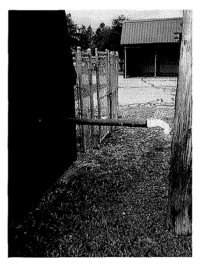
<u>Image 1(Stack Pipe)</u>: Pipe was once attached to a stack. Stack has been removed.