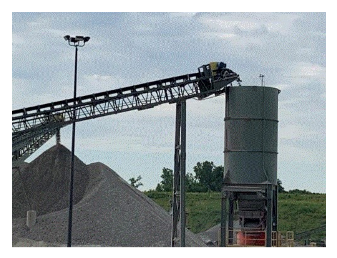
Image 4(Cone Crusher 4): B4922 view top of conveyor drop to crusher 061324