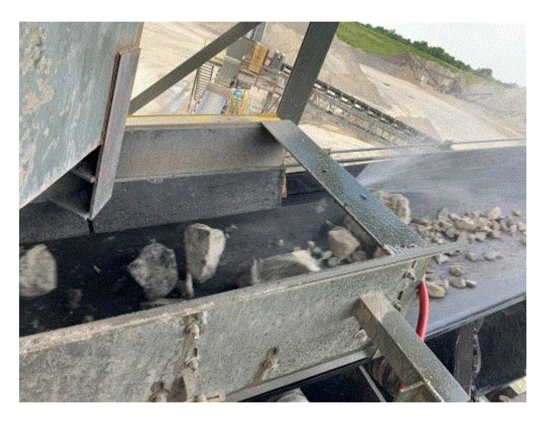
Image 1(Cone Crusher 1): B4922 spray nozzle added top of cone crusher 061324