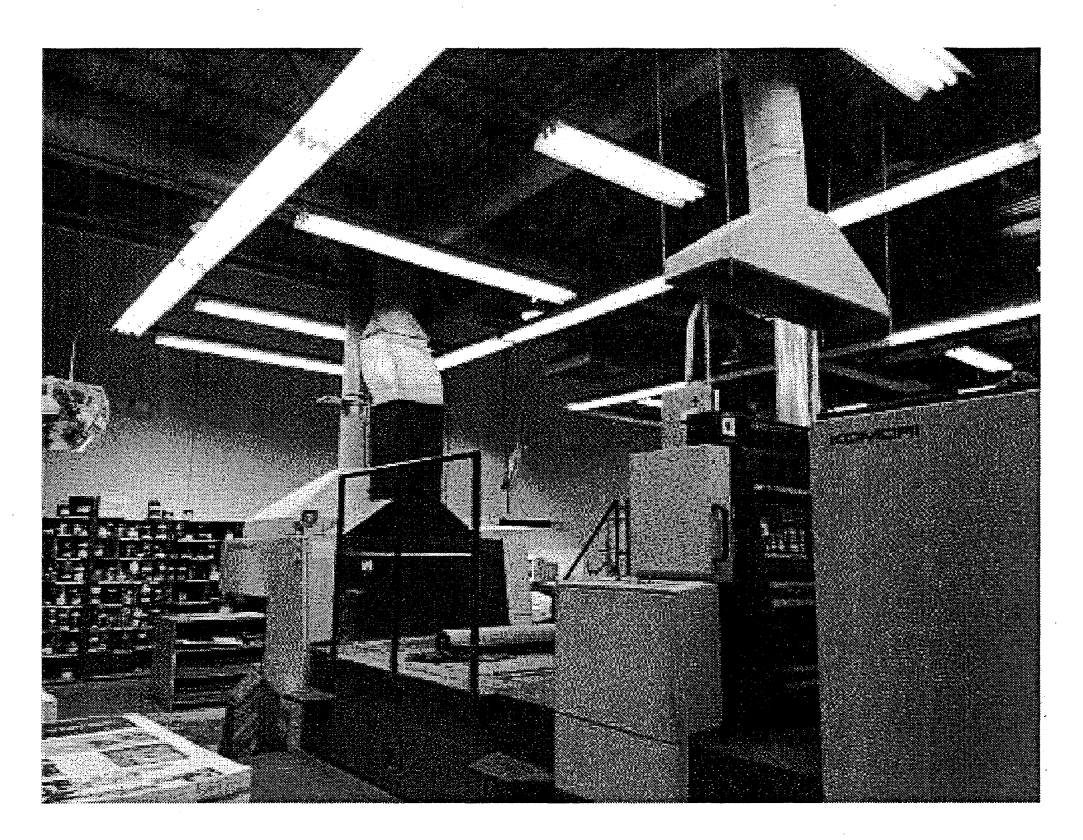
<u>Image 3(Lithographic printer)</u>: Hood collection system from one of the lithographic printers.