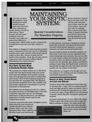
Maintaining Your Septic System