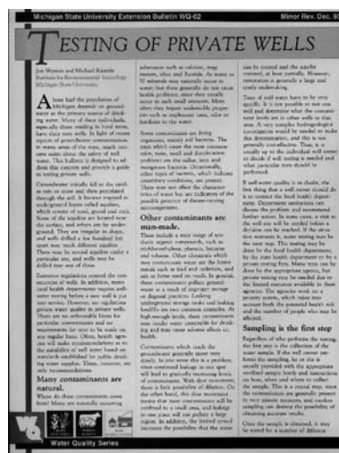
Testing of Private Wells