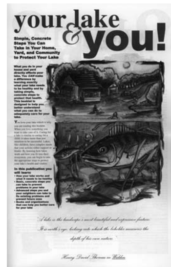
Your Lake & You!