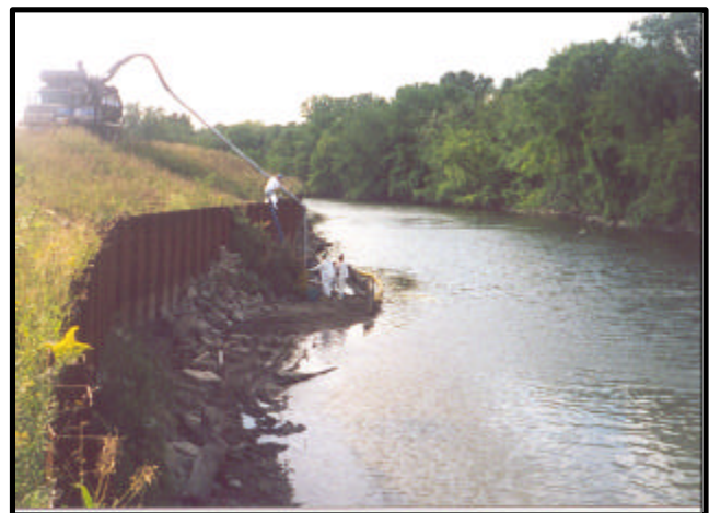
Excavation of paper-making residuals along King Highway