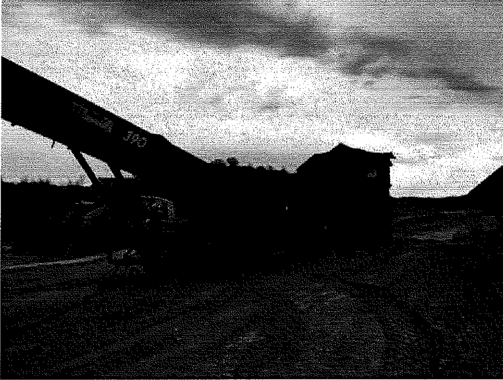
Image 3(feedhopper) : view of feed hopper and prescreen portion of finlay 390 screen (ID 4490)