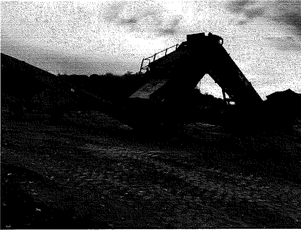
Image 1(screen discharge) : view of screen discharge points. Note that the Finlay 390 screen (Id 4490) discharges into 2 different conveyors. Both have the same ID no. "4501"