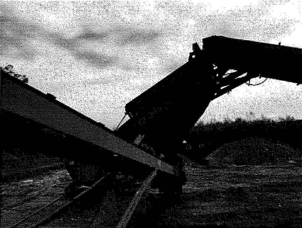
Image 2(sideview of screen) : sideview of finlay390 screen (Id 4490) showing the two discharge points onto conveyors, both finlay conveyors, with the same ID (Id 4501).