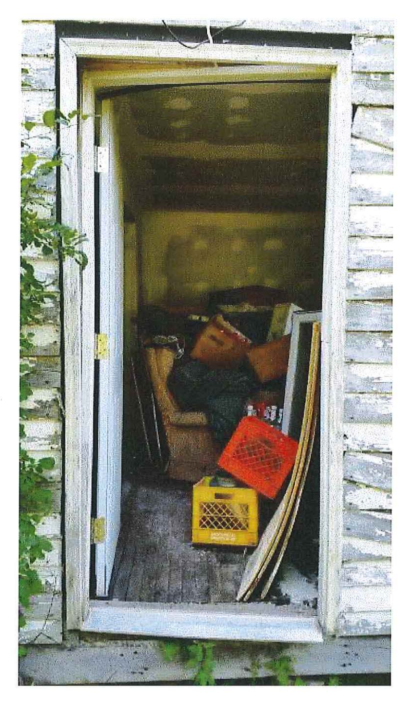
Image 3(IRopal3): Interior of residence--full of miscellaneous household furniture and garbage.