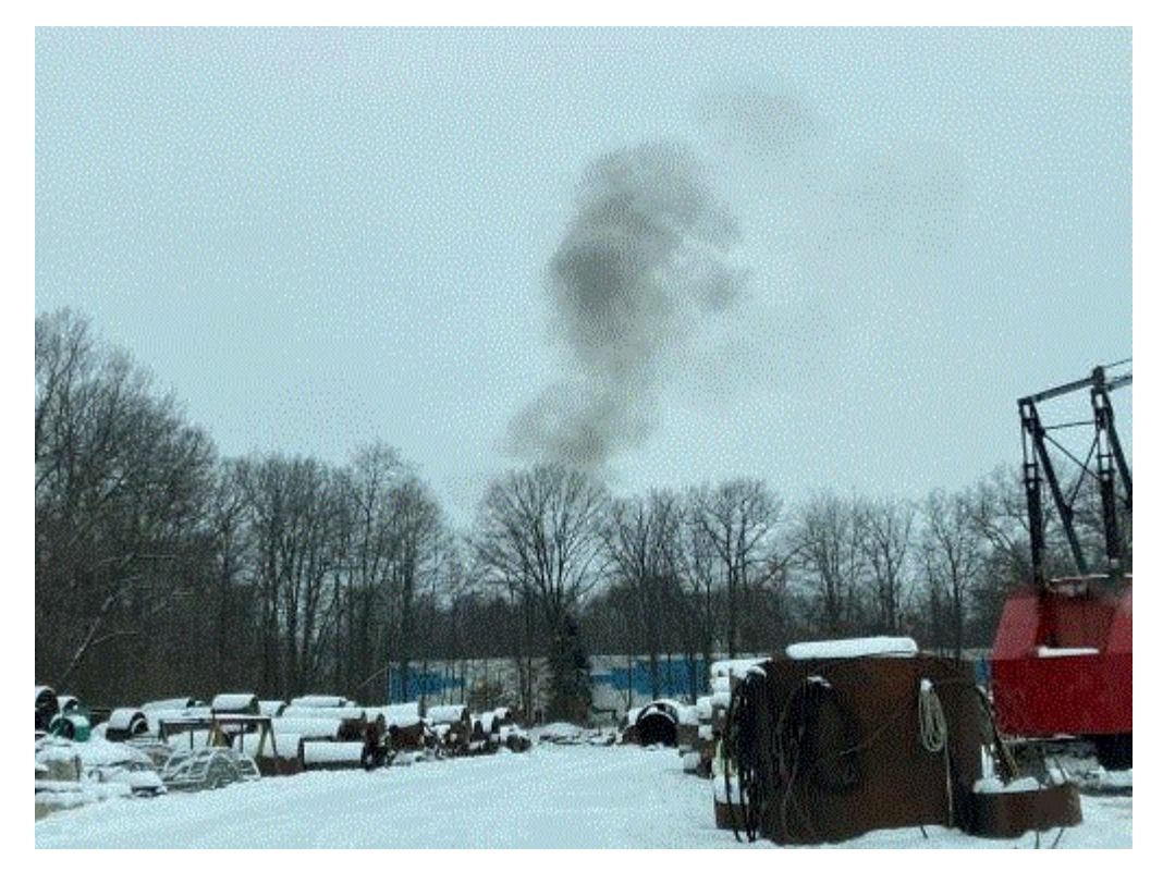
Image 1(IMG_0116.JPG) : View of black smoke plume from Great Lakes Cremation Service from the east. Image taken on February 10, 2020.