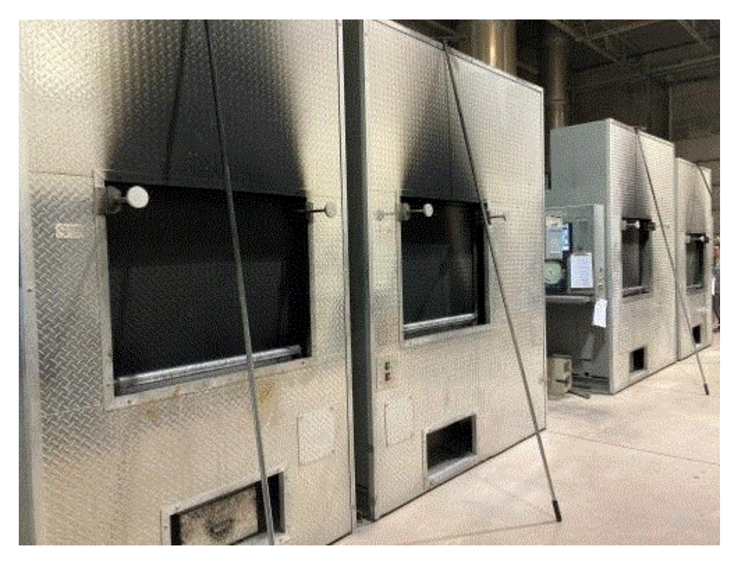
Image 2(IMG_0135.JPGIMG_0135) : View of soot deposits on the crematory doors. Image taken on February 10, 2020.

Image 1(IMG_0116.JPG) : View of black smoke plume from Great Lakes Cremation Service from the east. Image taken on February 10, 2020.