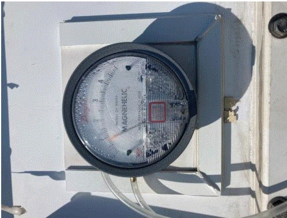
Image 2(Cyclomaster Line) : Cyclomaster Line inlet pressure drop gauge with moisture. Image should be viewed rotated one turn clockwise.