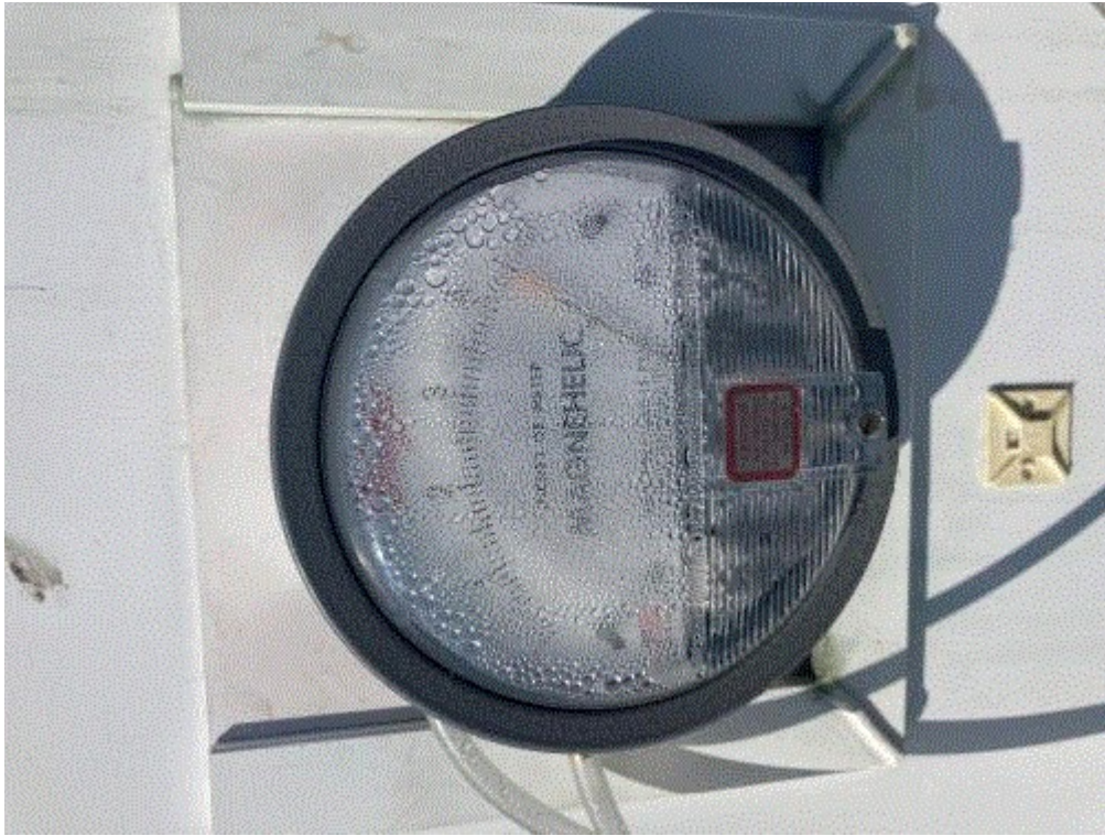
Image 3(Cyclmaster Line) : Cyclmaster Line outlet pressure drop gauge with moisture. Image should be viewed rotated one turn clockwise.