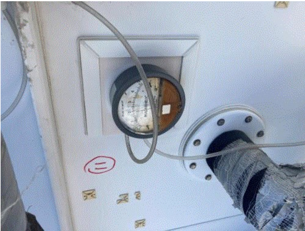
Image 1(Hoist Line) : Hoist Line pressure drop gauge with water in it. Image should be viewed rotated one turn clockwise.