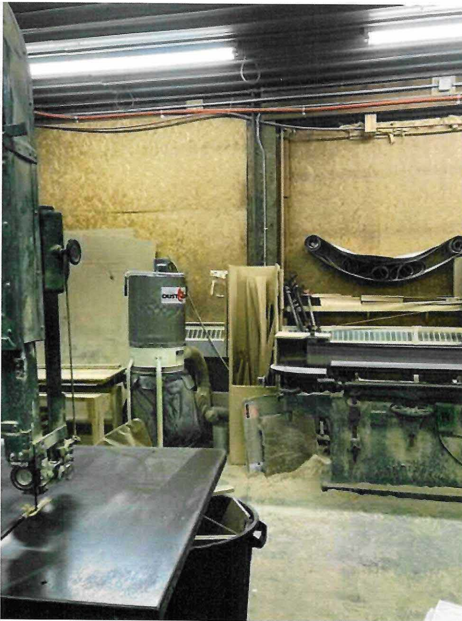
Photo Description: Wood finishing machine attached to a baghouse venting only indoors.