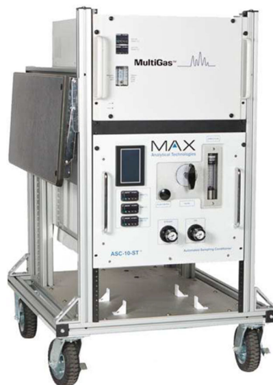
Figure 1: MKS MultiGas 2030 FTIR and ASC-10ST

For oxygen measurement, prior to testing, sample system bias checks and instrument linearity checks (calibration error) were completed. In addition, the analysers were calibrated (zeroed and span checked) at the completion of each run. A data logger system programmed to collect and record data at 1- second intervals was used to compute and record one-minute average concentrations.