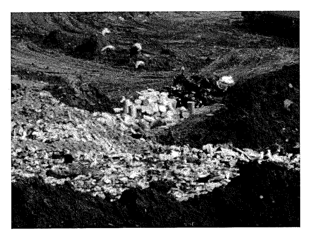
Image 12(Asbestos disposal) : Asbestos disposal-North active face.