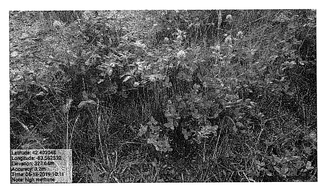
Image 5(High methane) : High methane location on NW part of landfill just above West haul road.