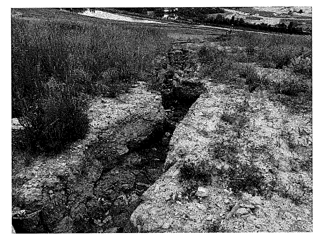
Image 8(Drainage ditch) : Drainage ditch on North slope with high methane/H2S.