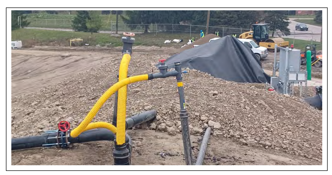
Photo #2 – Liner installed over the leachate cleanout risers to address the penetrations. 3-inch vacuum line installed under liner to maintain negative pressure.