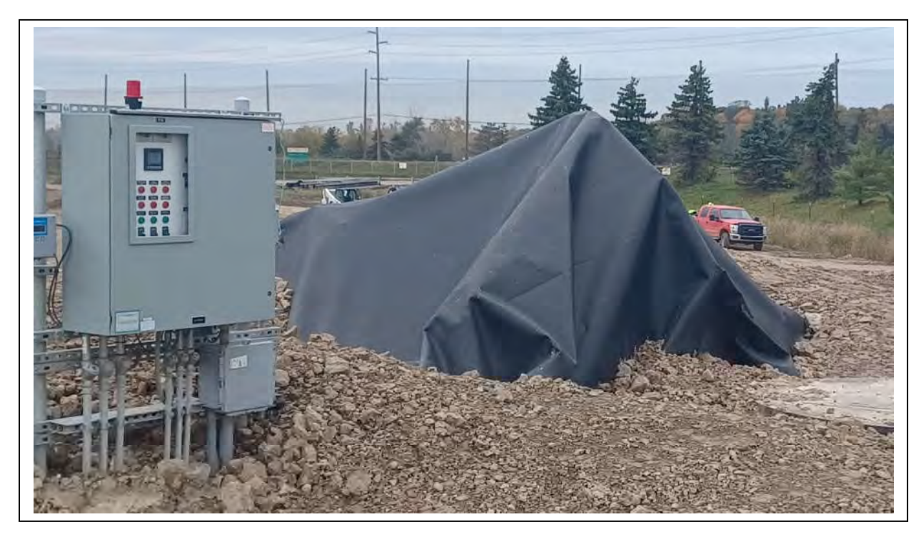
Photo #3 – View looking from the southeast of the liner covered cleanout risers.