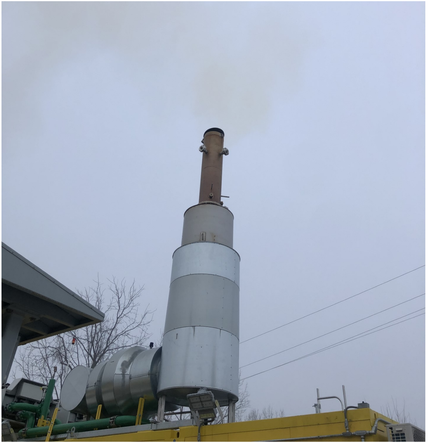
Unit 3-25% load. All other caps function in similar fashion.