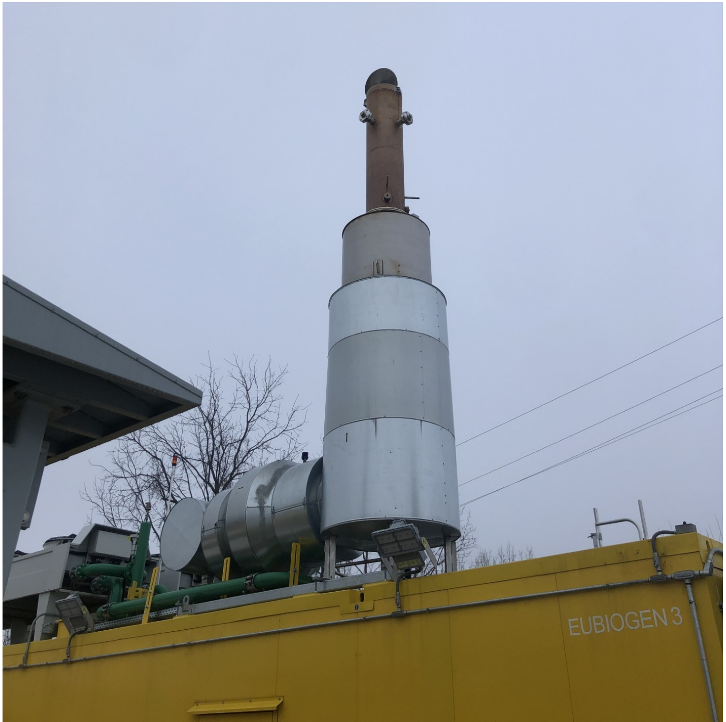
Unit 3-75% Load