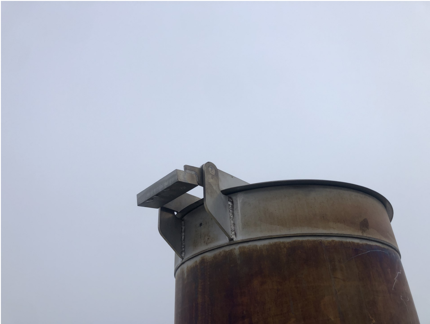
Rain cap on unit 3. All other caps in similar condition.