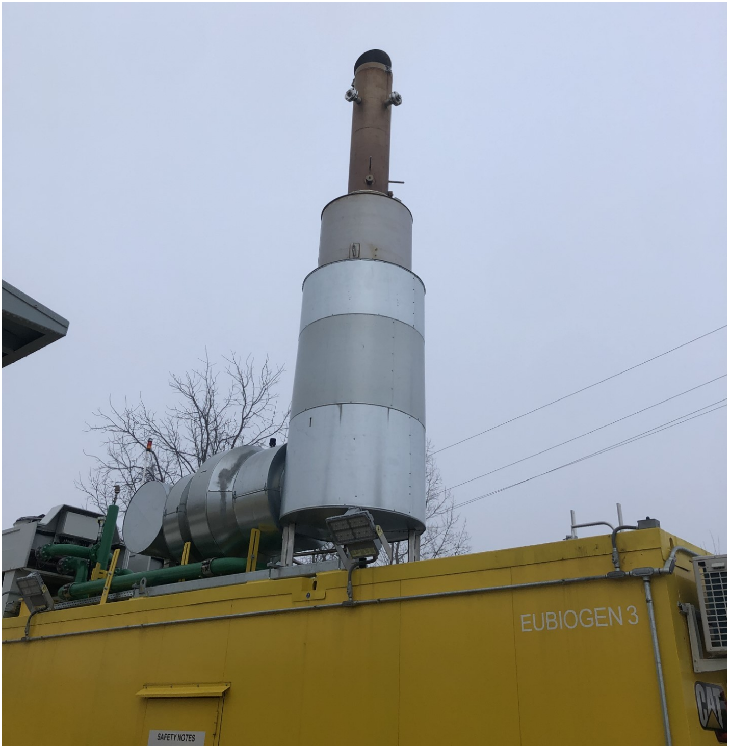
Unit 3-50% load. All other units operate in similar fashion.