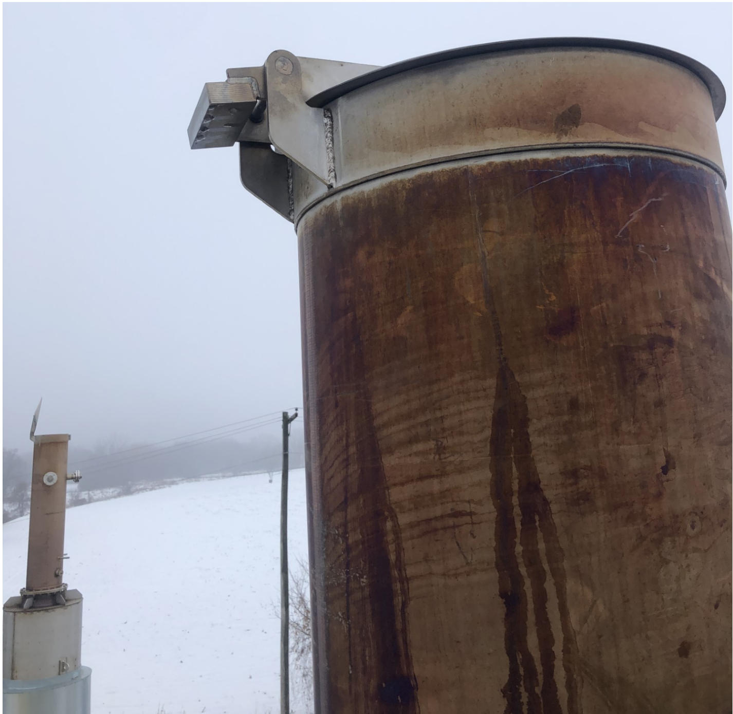
Unit 4 Cap with Unit 3 in background at 100% load. All caps function in similar fashion per load.