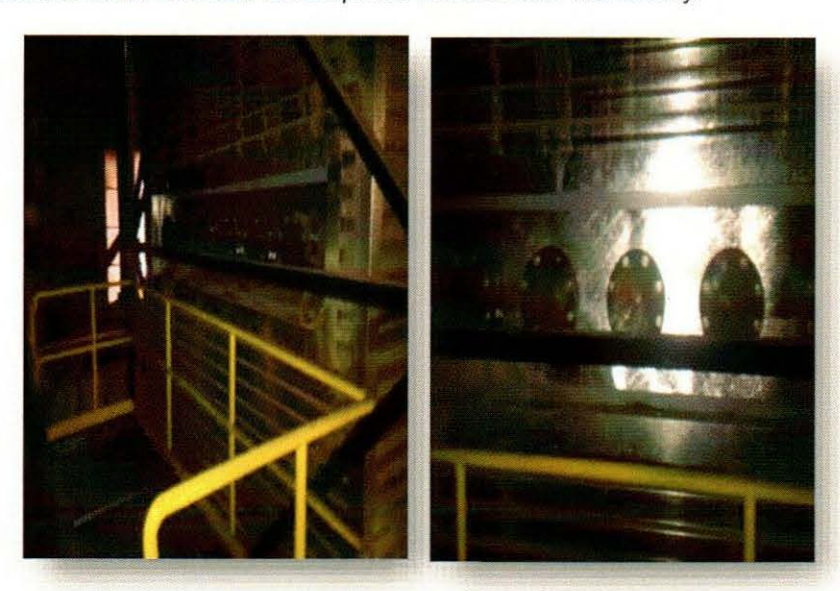
Figure 3.1: RATA Sampling Location

The sampling ports for the RATA testing were located on the common exhaust duct for Boiler 6 and Boiler 7 that discharge the emissions from each boiler. During the RATA, Detroit Thermal personnel were able to isolate each of the boilers so the RATA would be completed on each boiler individually.