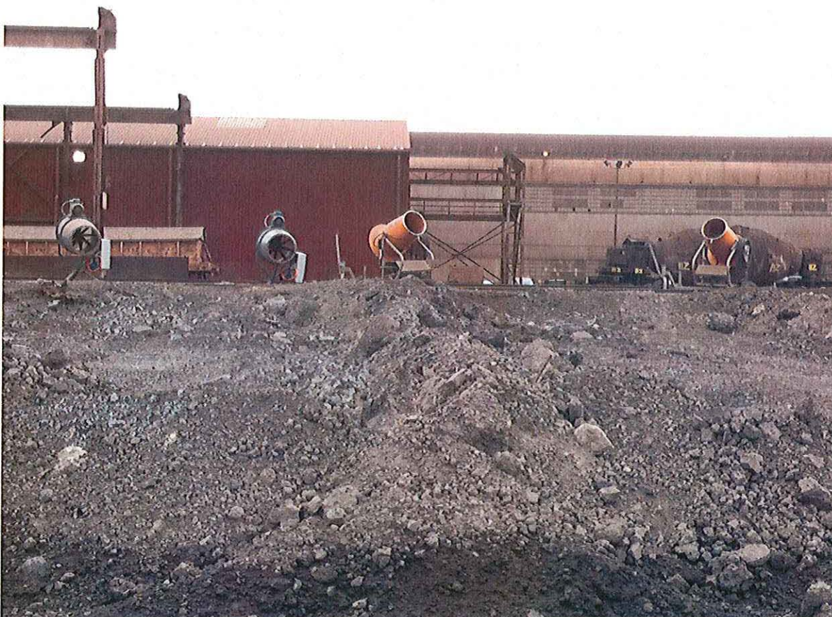
Water Misting Fans

NOTE: 4 Water misting fans are to be utilized for all pouring and digging activities.