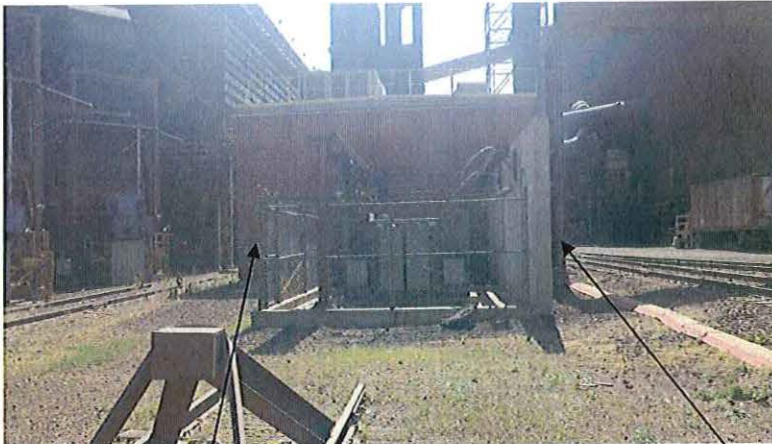
Disconnects for water misters power